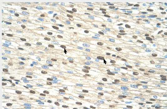
RIPK3 antibody - N-terminal region (AI10021) in Human Heart cells using Immunohistochemistry Human Heart